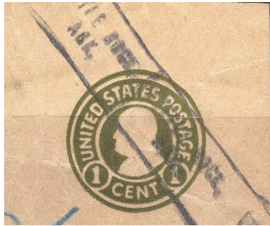
2 nd class mail box-roller 4.4613