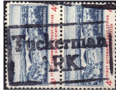
Automated mail with HS 2.6257

The normal state abbrev is ARK, unless listed (ie: AR )