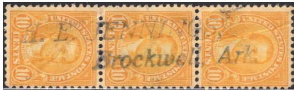
1.2250001 poss integral with Postmaster's name

The following are illustrations of Types with PIC Note in the listing.