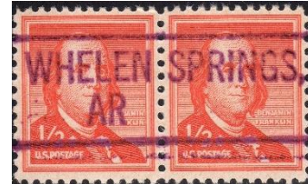
ST n/p (no zip) 2.46