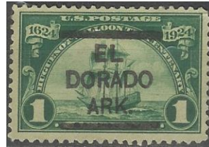
0.7673 single subj HS